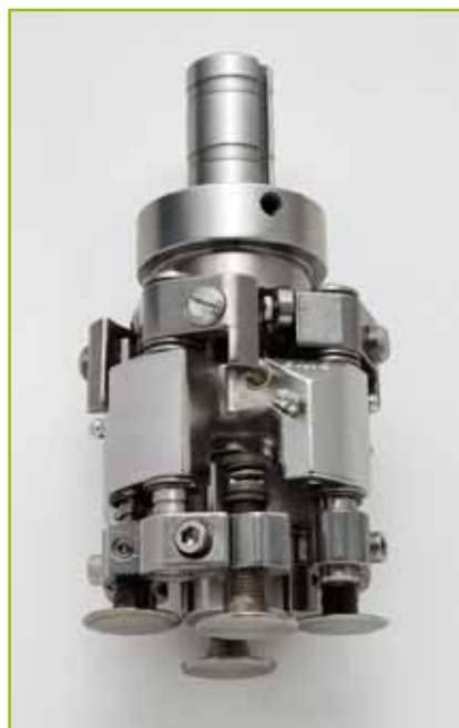
Testina TF 1000/4 Capping head TF 1000/4

Push buttons working mode with electric cabinet 380V 50Hz and safety doors according to EC standards.